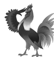
Passport to Peru

Vacation Bible Adventure Dig into God's good gifts! Join us for a high-energy, fun, Vacation Bible Adventure. Parents of 3-year-olds – 4 th graders, register now for Passport to Peru , our cross-culture VBA.